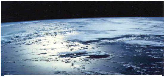
“Renewable solutions for a finite planet since 1973”